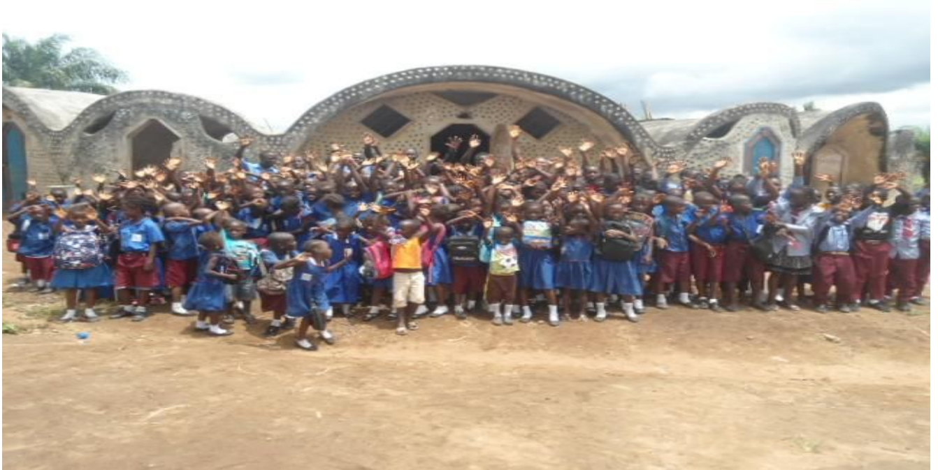
Above: Goderich Waldorf School students pose for photo on first day of school reopening

School reopened on September 11, 2017 and 245 children returned from the long vacation which started in July. Certainly students always look forward to returning to school and re-join their friends and teachers.